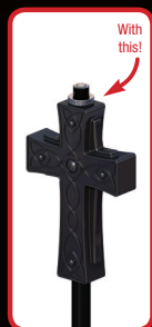
Replace with Custom Mic Stand Topper