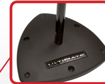
Die-cast, sturdy weighted base