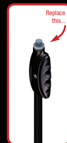
Remove Live Series Mic Stand Clutch

The Custom Mic Stand Topper becomes a one-hand clutch that lets you adjust the height of your microphone with a quick, simple squeeze!