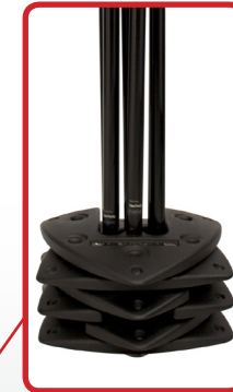
Live-SB combines the stability of a weighted base with the ability to stack six of them in the same space as just one!