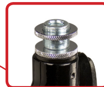
Patented universal mic attachment - US and metric