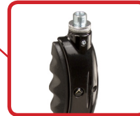
Ergo Clutch - One-handed height adjustment