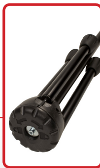
Locking tripod base for stable performance and convenient transport