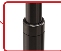
Durable, lightweight aluminum construction