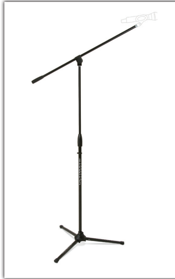
MC-40 Weighted Base Mic Stand