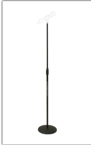
MC-05 Tripod Mic Stand

Innovation and strength are the two cornerstones on which Ultimate Support has built their reputation. The Classic Series microphone stands not only deliver features such as a quick-release, quiet, and reliable clutch, built-in cable management clips, and super stable bases, but they're competitively priced with mic stands that, well, simply don't stand up (pun intended). The MC-40 and MC-05 microphone stands are the finest professional mic stands you can find at entry-level mic stand prices.