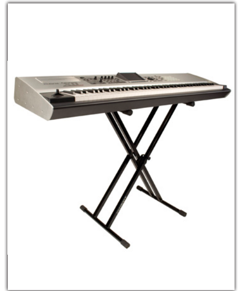
IQ-2000 Double Brace X-Stand