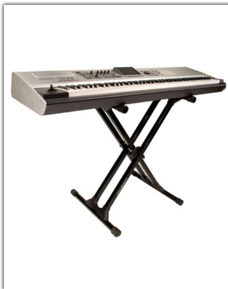
IQ-3000 Reinforced Double Brace X-Stand

ULTIMATE SUPPORT™ LIMITED LIFETIME WARRANTY