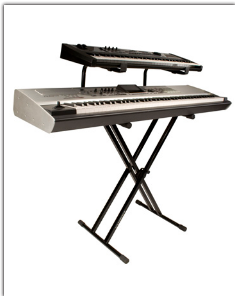
IQ-2200 Signal Brace X-Stand with Second Tier