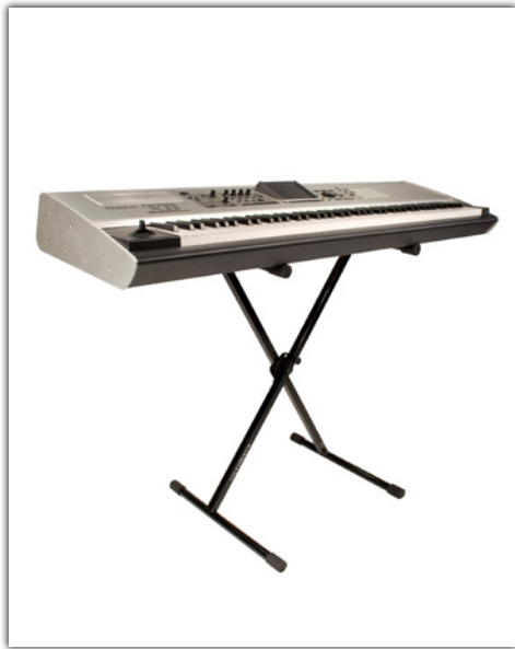
IQ-1000 Signal Brace X-Stand

The IQ Series redefines the X-style keyboard stand, bringing a new level of stability and innovation to the lightweight, gigging-minded design. Offering a range of height settings for sitting-to-standing playing comfort, the IQ-1000, IQ-1200, IQ-2000, IQ-2200 and IQ-3000 all feature Ultimate Support's patented Memory Lock system and unique stabilizing end caps, giving keyboardists timesaving onstage luxuries along with peace of mind. IQ Series stands hold true to Ultimate Support's twofold commitment – providing uncompromising instrument stability while remaining at the forefront of musician-centric, innovative design – and are ideal for supporting everything from lightweight synthesizers and MIDI controllers to the heaviest of professional keyboard workstations.