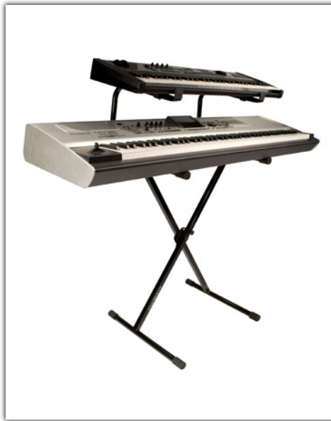
IQ-1200 Signal Brace X-Stand with Second Tier