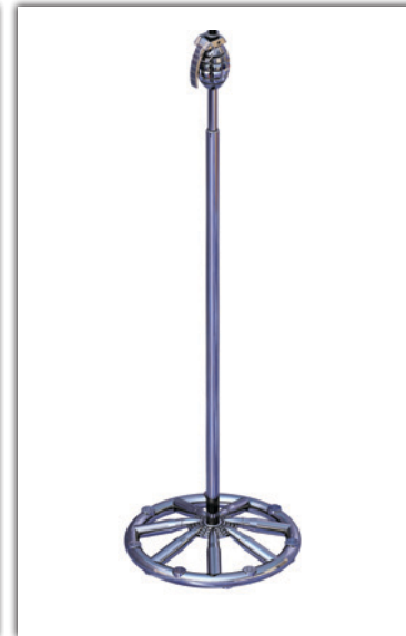
CUSTOM-3 "BRING IT ON, SUCKA!"