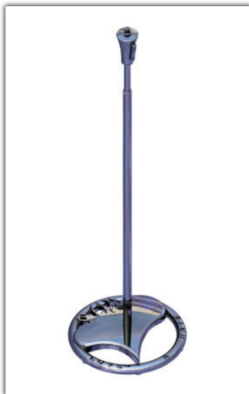
CUSTOM-4 "LOVE · HATE"