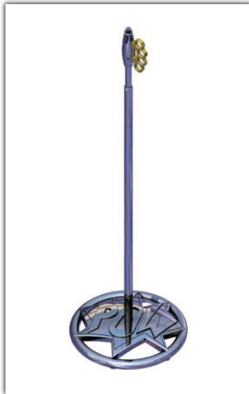
CUSTOM-1 "ARE YOU TALKIN' TO ME?"

Are you ready to add some personality to your stage presence? The Custom Chrome Series from Ultimate Support feature a one-hand height adjustment for maximum flexibility, a super strong and reflective finish that looks stunning under stage lights, unique personality-driven designs, and ships with a gig bag that houses the base and the mic shaft (plus whatever else you want to put in it). The Custom Chrome Series are a must-have for any lead singer's arsenal and sure to become the centerpiece of any stage!