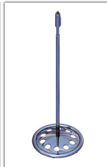
CUSTOM-6 "Smell the Rubber"