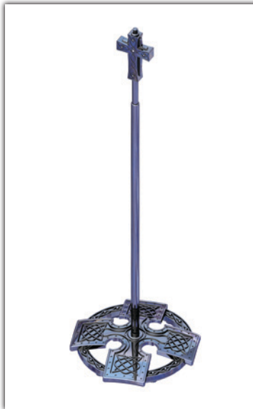
CUSTOM-2 "DARK MAGIC"