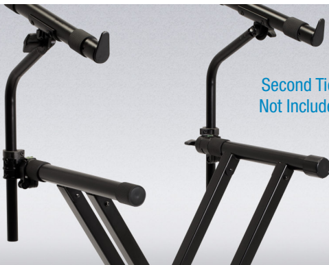
Second Tier Not Included

There are two stabilizing end caps. These caps allow the musician to adjust the stand on uneven surfaces.